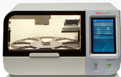
Thermo Scientific™ KingFisher™ Apex system*

Count on the flexibility of KingFisher Apex automated purification systems, plus your choice of kits and consumables, to support multiple applications in your lab.