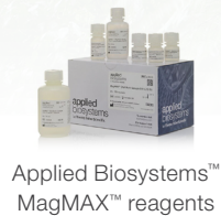
Applied Biosystems™ MagMAX™ reagents