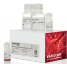
Invitrogen™ Dynabeads™ magnetic beads